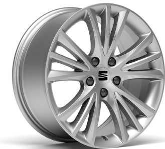
DYNAMIC 17" ALLOY WHEELS SE+