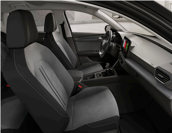
CLOTH - AX