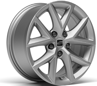
URBAN 16" ALLOY WHEELS SE